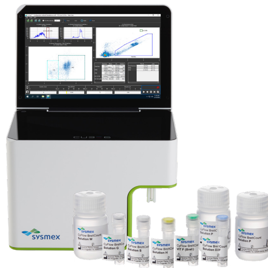
CyFlow Cube 6 V2m with CyFlow BrettCount reagent kit